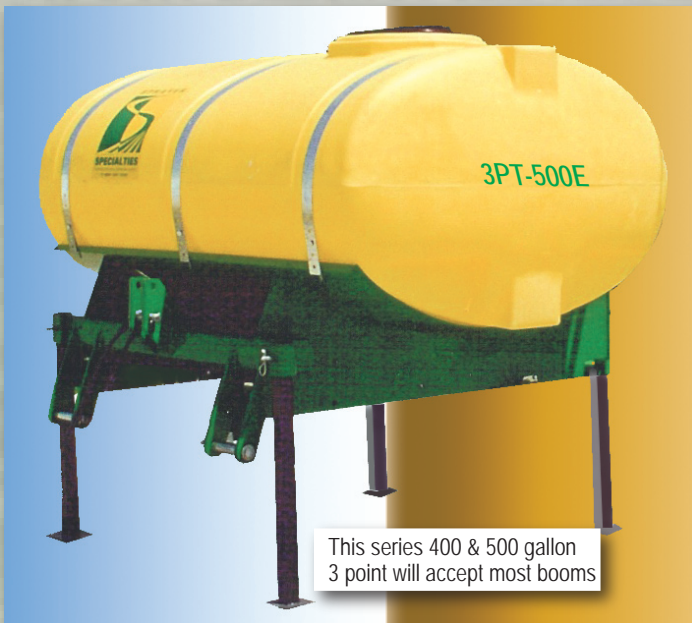
This series 400 & 500 gallon 3 point will accept most booms

400 & 500 Gallon 3 Pts. with Elliptical Tanks Fits Category 2 & 3 Hitch, Quick or Standrad 3Pt. Hitch. Available with 400 or 500 Gallon Poly Tank. Nylon or Steel Throughout, Completely Non-corrosive. Pins are Included.