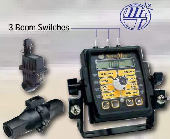
3 Boom Switches

The SprayMate proves again that you don't need to spend a lot to get accurate application control. It automatically maintains a preset application rate and can be used for both chemical and NH3 application. Features the same solid, space-saving design of the new Calc-An-Acre and Flow-Trak.