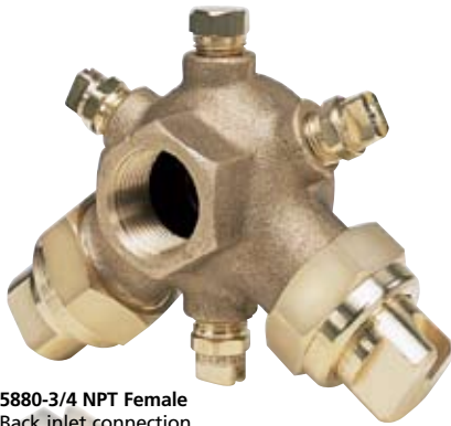
5880-3/4 NPT Female Back inlet connection. Weight: Brass 2 lbs.

Type 5880 BoomJet Nozzle is used for spraying areas not easily accessed with a boom sprayer. It combines two off-center tips and three VeeJet® nozzles to produce an overall wide swath flat spray. The nozzle assembly provides good distribution considering the wide pattern coverage obtained; however, the uniformity is not as good as with a properly operated boom sprayer.* Supplied with one additional 1/4" NPT pipe plug and one blank tip for setting BoomJet to one side only. Also has a 1/4" NPT pressure gauge port.