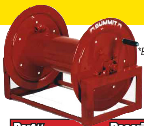
SM18 Manual Reel *Black is Stock Color